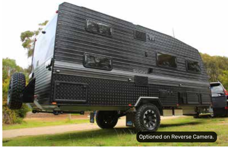
Optioned on Reverse Camera.

The Scout is built on a rock solid platform! With the 6" Australian made DuraGal steel chassis and 2.7t Tuff Ride suspension you'll be ready for any Aussie off road track including the very popular Gibb River Road Oodnadatta Track.