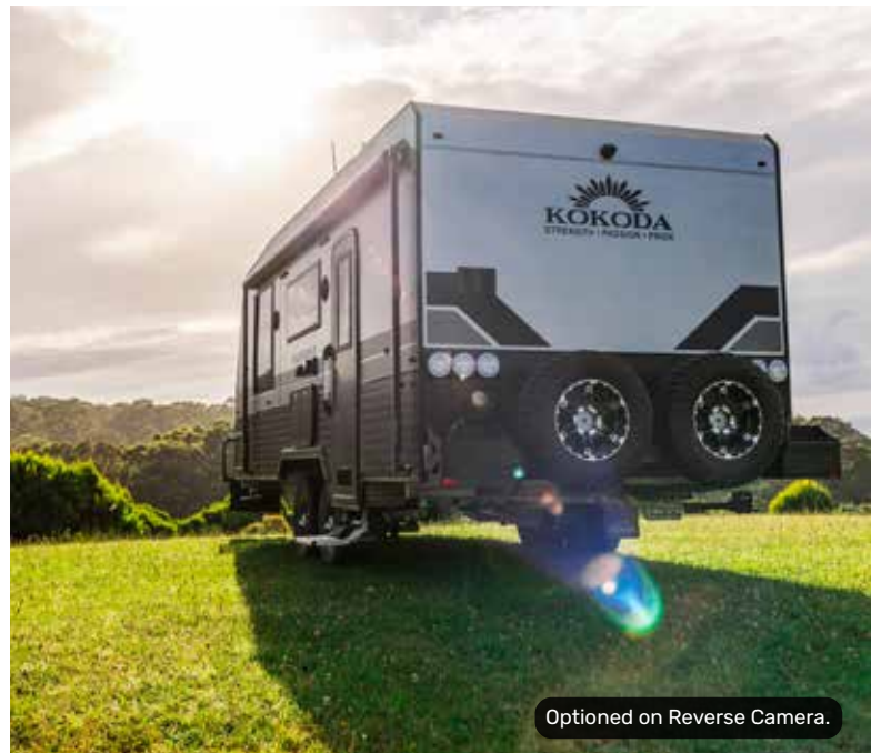
Optioned on Reverse Camera.

When double standards are a good thing we're referring to the Kokoda Off-Road Standards. 2x95ltr water tanks, 2x100AH deep cycle batteries, 2x9kg gas bottles, 2x140w solar panels, 2x20ltr jerry can holders and 2x full size spare tyres. Double your fun exploring every exciting corner of Australia in the Platoon 2. And when you do, don't forget to write or tag us to share your story!