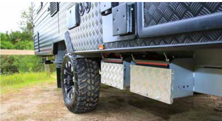
*Please Note: Some images that have been used contain upgrades/optioned add ons.