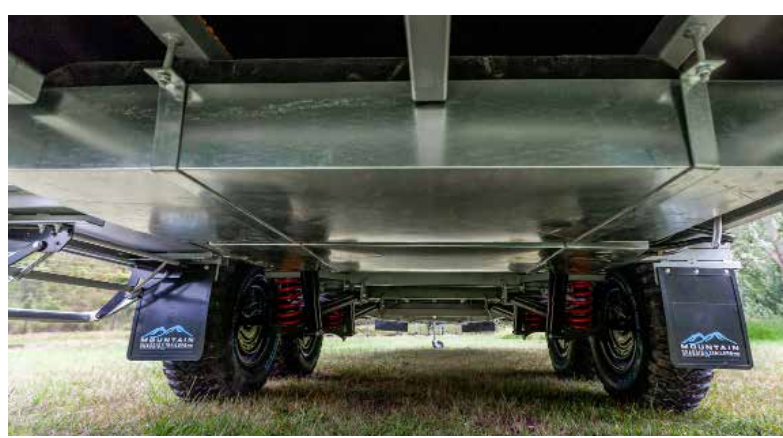
*Please Note: Some images that have been used contain upgrades/optioned add ons.

T: 1800 577 430 E: ENQUIRIES@KOKODACARAVANS.COM.AU